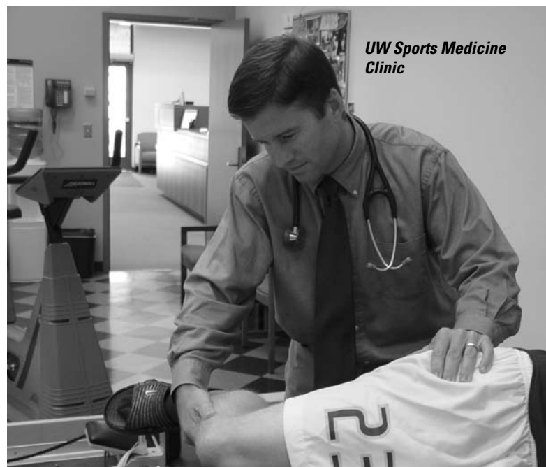
UW Sports Medicine Clinic