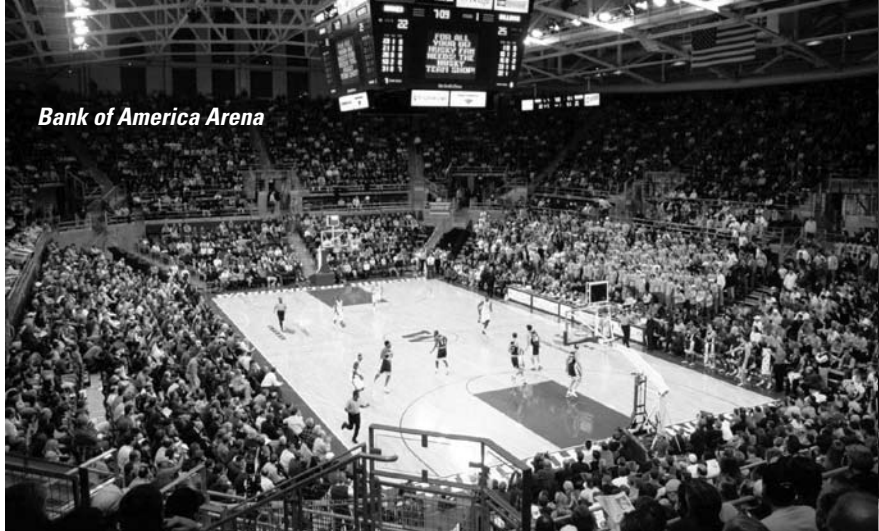
Bank of America Arena