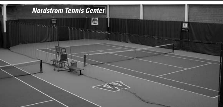
Nordstrom Tennis Center