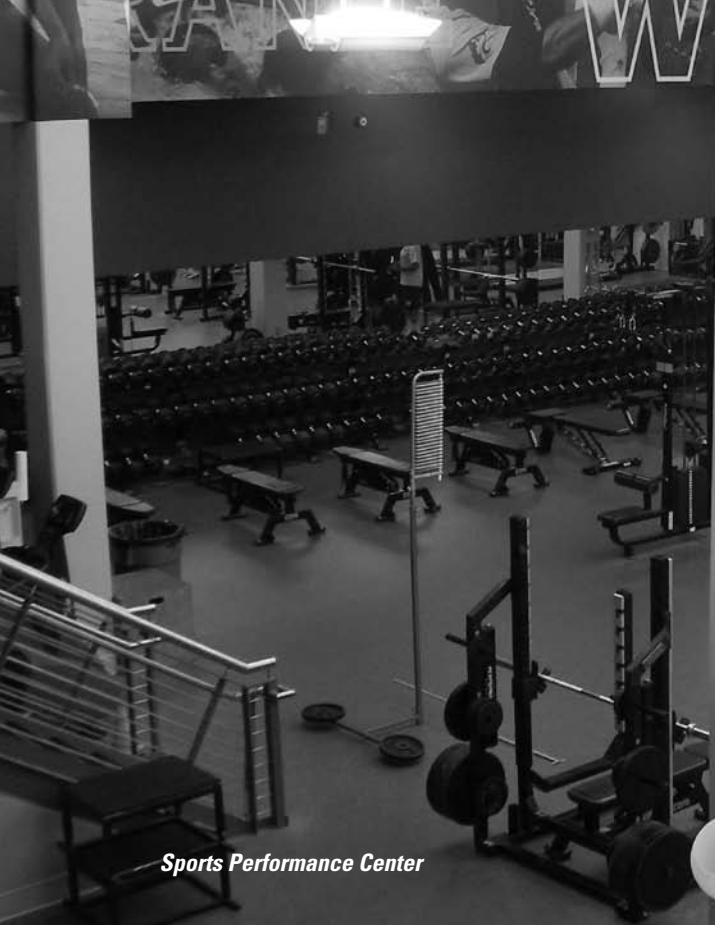
Sports Performance Center