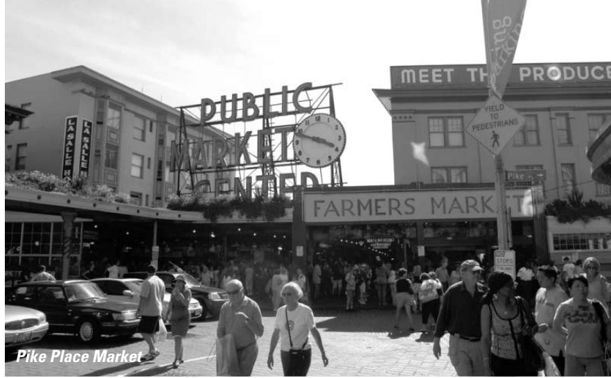
Pike Place Market