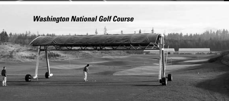
Washington National Golf Course