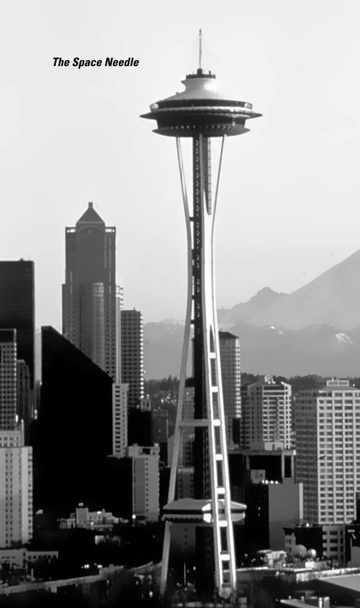
The Space Needle