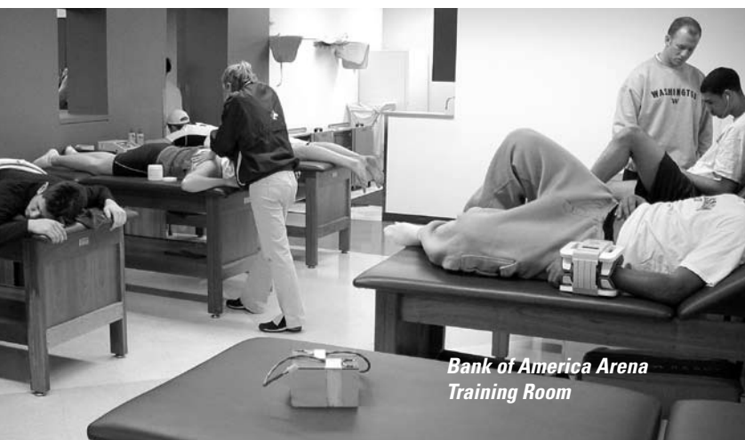
Bank of America Arena Training Room