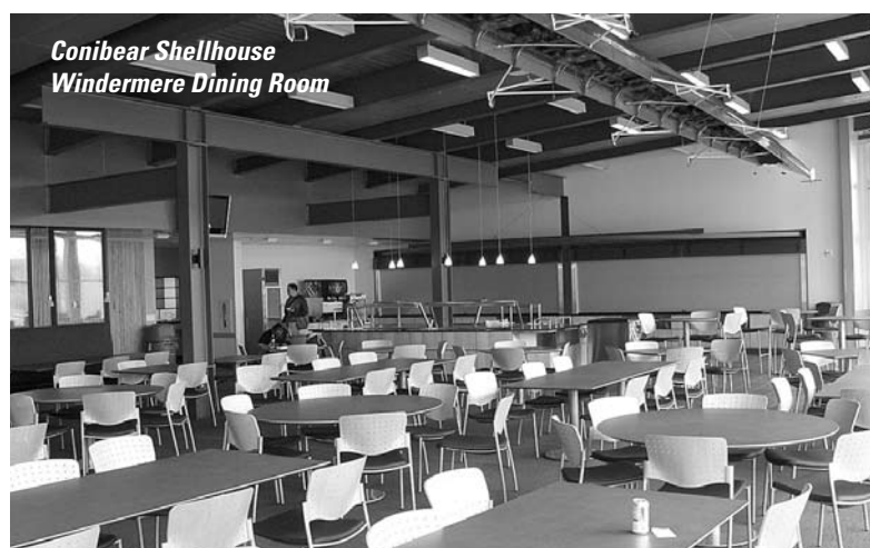
Conibear Shellhouse Windermere Dining Room

Washington's Sports Performance program, meanwhile, has recently moved into one of the nation's finest weight room facilities, housing a balance of machine apparatus and free weights, as well as a variety of modern fitness equipment and access to some of the country's elite sports performance experts.