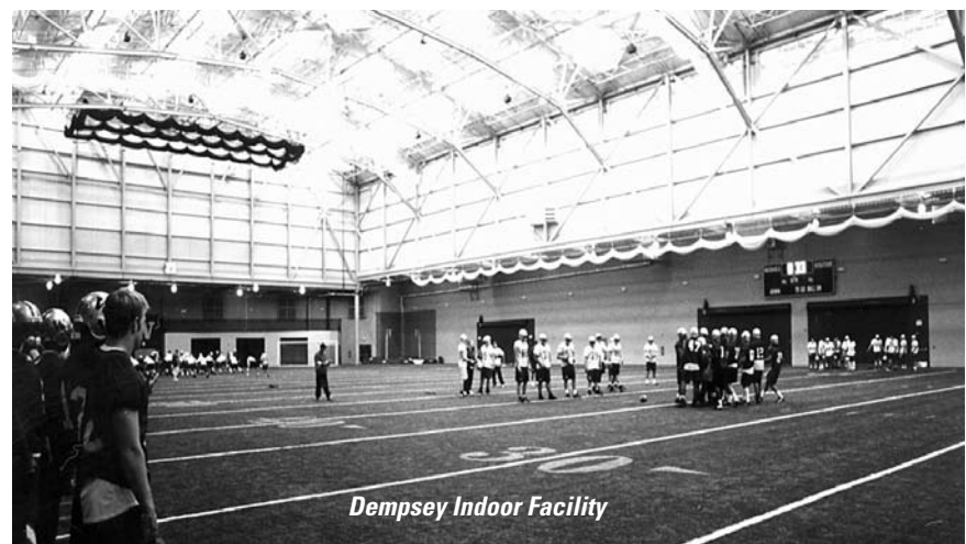
Dempsey Indoor Facility

Washington's athletic success is no coincidence -- Husky athletes train and compete in some of the finest athletic facilities anywhere in the nation. Husky Stadium, home to Washington's football team, is ranked on nearly every list of America's top college football venues, while state-of-the-art Bank of America Arena has earned a reputation as one of the nation's most intimidating road venues. The nation's top tennis and track teams flock to UW's Nordstrom Tennis Center and Dempsey Indoor track and field facility, while the sparkling new Conibear Shellhouse - which houses the student-athlete dining hall, study rooms, a state-of-the-art computer lab and a student-athlete lounge complete with sofas and plasma TVs, as well as the offices, shellhouses and trophies of UW's crew program — is easily America's finest collegiate rowing facility. Washington also boasts outstanding soccer, baseball and softball stadiums, competes in some of America's top golf courses and swimming facilities.