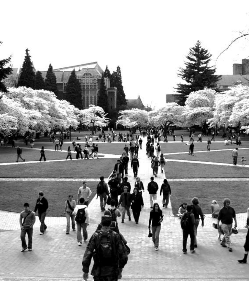
Rainier Vista and Drumheller Fountain